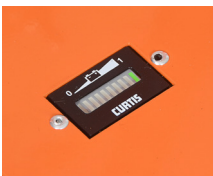
Battery Power Meter