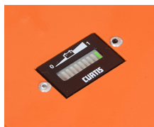
Battery Power Meter