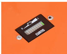
Battery Power Meter