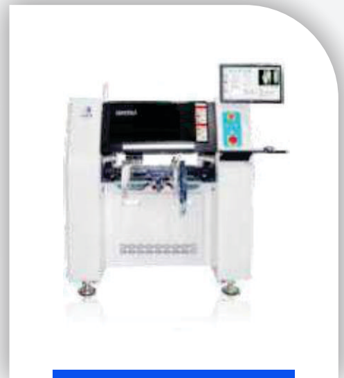
Smt Pick And Place Machine