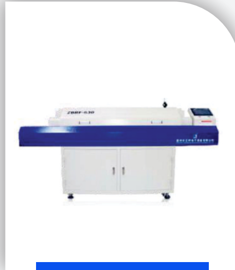
Zone Smt Reflow Oven