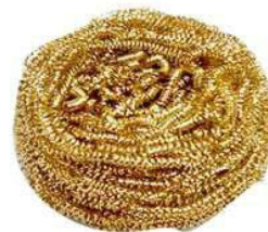
Brass wool sponge