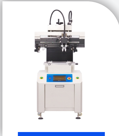
Automatic Stencil Printing