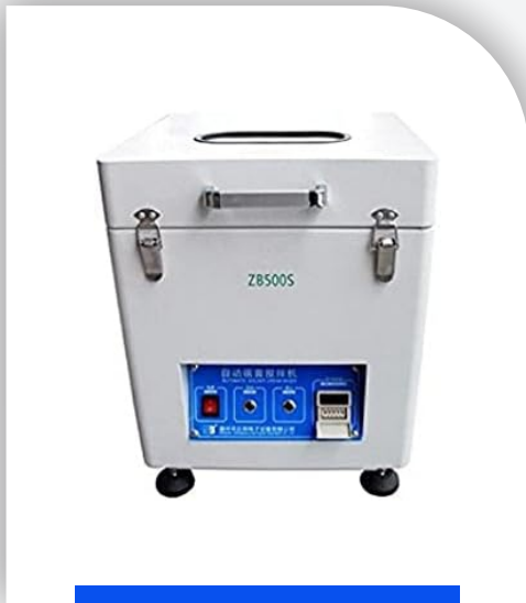
Solder Paste Mixer