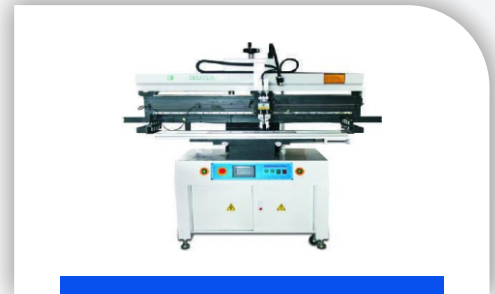
SMD Stencil Printer